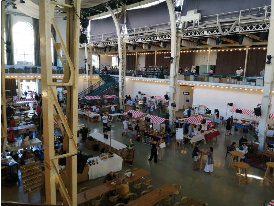
Bratislava old market

Here are some photographs of Judith's epic journey.